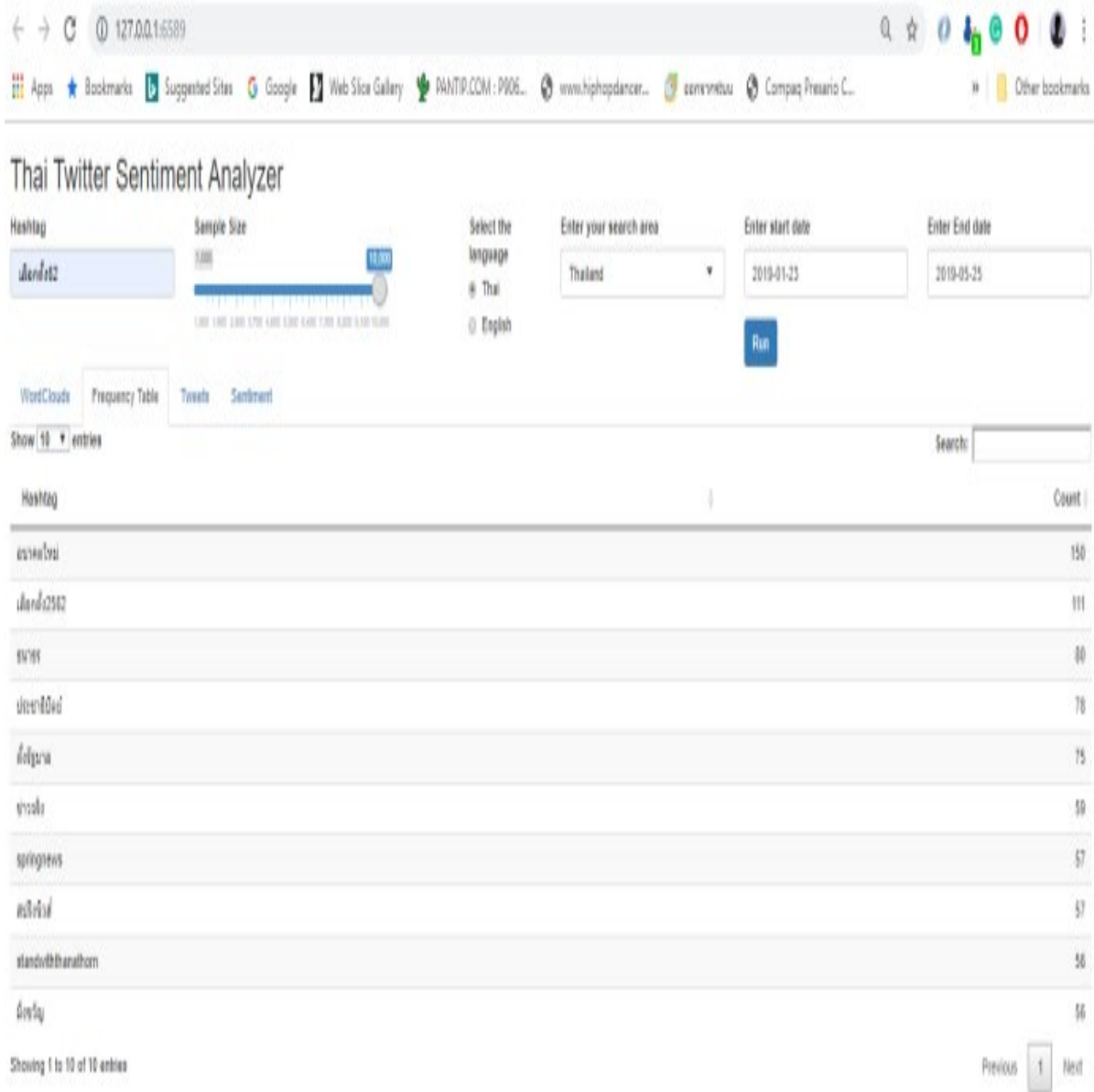
Figure 2 Word frequency table list

We analyse the association between frequent terms (i.e., terms which correlate) using the findAssocs function.