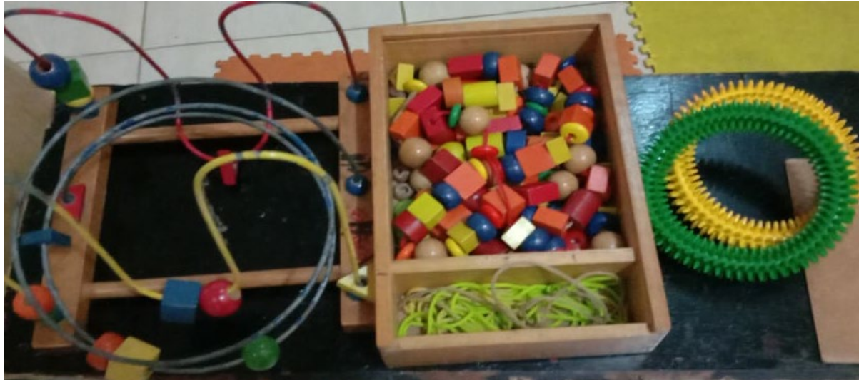
Figure 1. Mathematics learning media for DS student